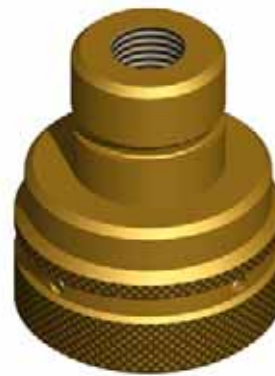
Figure 11 - Pneumatic Actuator (Part No. 304.209.004)

The pneumatic actuator is used to pneumatically operate the system at the container position and is fitted to the top of the valve assembly or removable electrical actuator. Pressure from a 'master' container is used to actuate the valve, via small bore piping or a flexible hose.